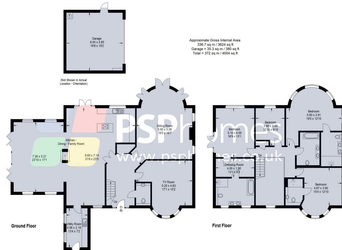
Illustration for identification purposes only, measurements are approximate, not to scale. Imageplansurveys @ 2020