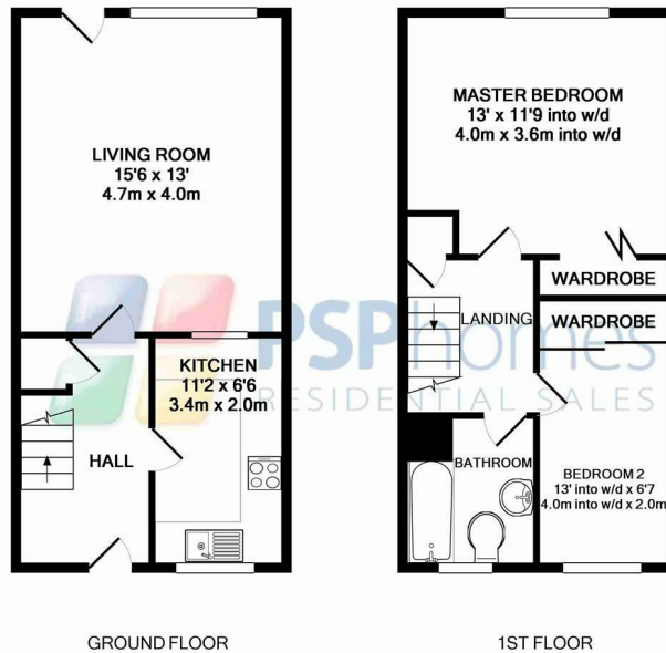
Plans for illustration purposes only Made with Metropix ©2010